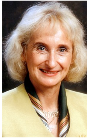
Baroness Sally Greengross

Baroness Greengross, co-chair of the Alliance for Health & the Future, is also executive chair of ILC - United Kingdom. In 2000 she was awarded a life peerage and appointed an independent member of the House of Lords. In Parliament, she is a member of Sub-Committee F (Social Affairs, Education and Home Affairs) of the House of Lords European Union Select Committee and chairs the all-party group on Corporate Social Responsibility.