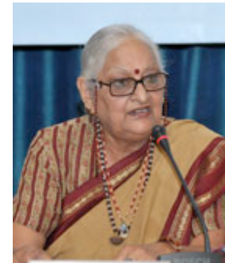
Dr. Mohini Giri

The Argentine Republic's domestic and international policies have embraced the needs and interests of an ageing population. Argentina is a member of the Commission for Social Development. Through their work on this commission and their continued advocacy work, Argentina has been a leader in promoting human rights instrument for the rights of older people at the United Nations.